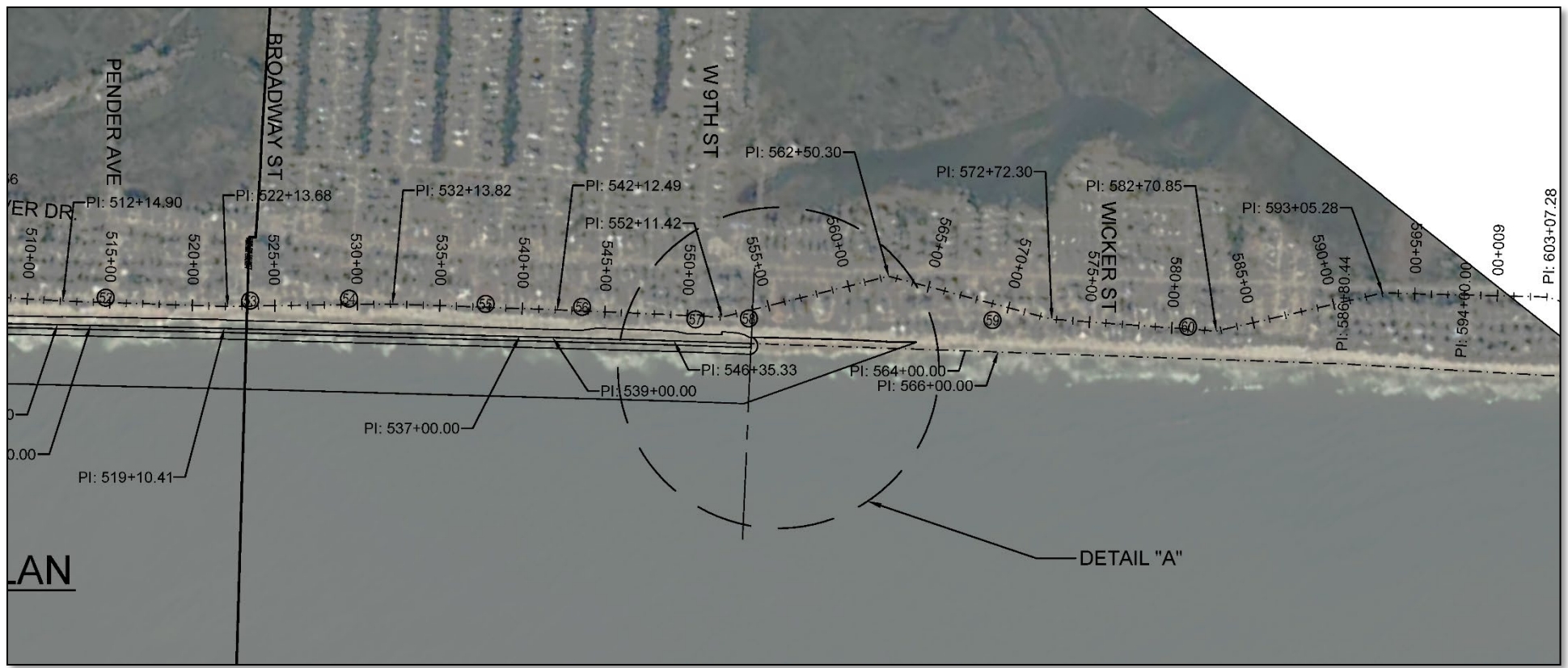
Figure 4. Northeastern Segment of the Recommended Plan.