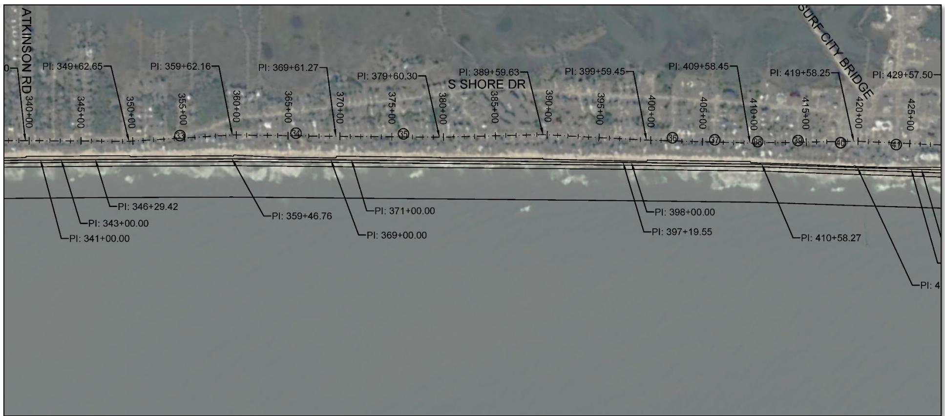
Figure 2. Middle Southwestern Segment of the Recommended Plan.