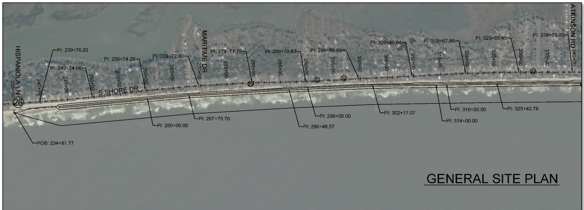
Figure 1. Southwestern Segment of the Recommended Plan.